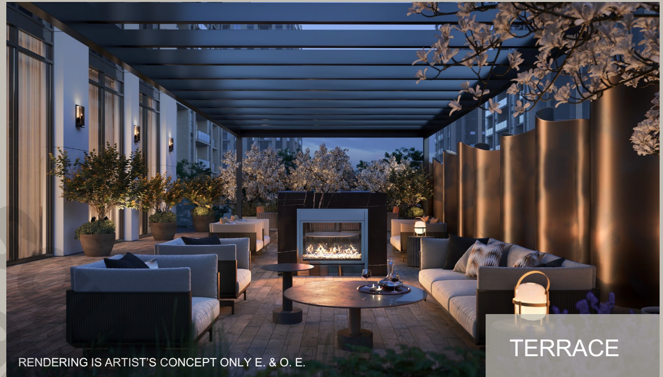
RENDERING IS ARTIST'S CONCEPT ONLY E. & O. E.