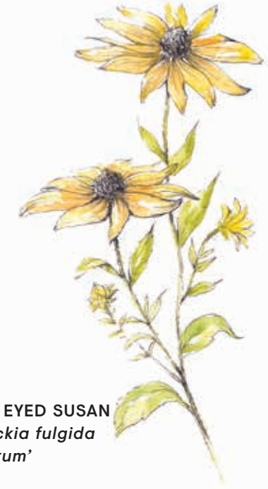
BLACK EYED SUSAN Rudbeckia fulgida 'Goldstrum'