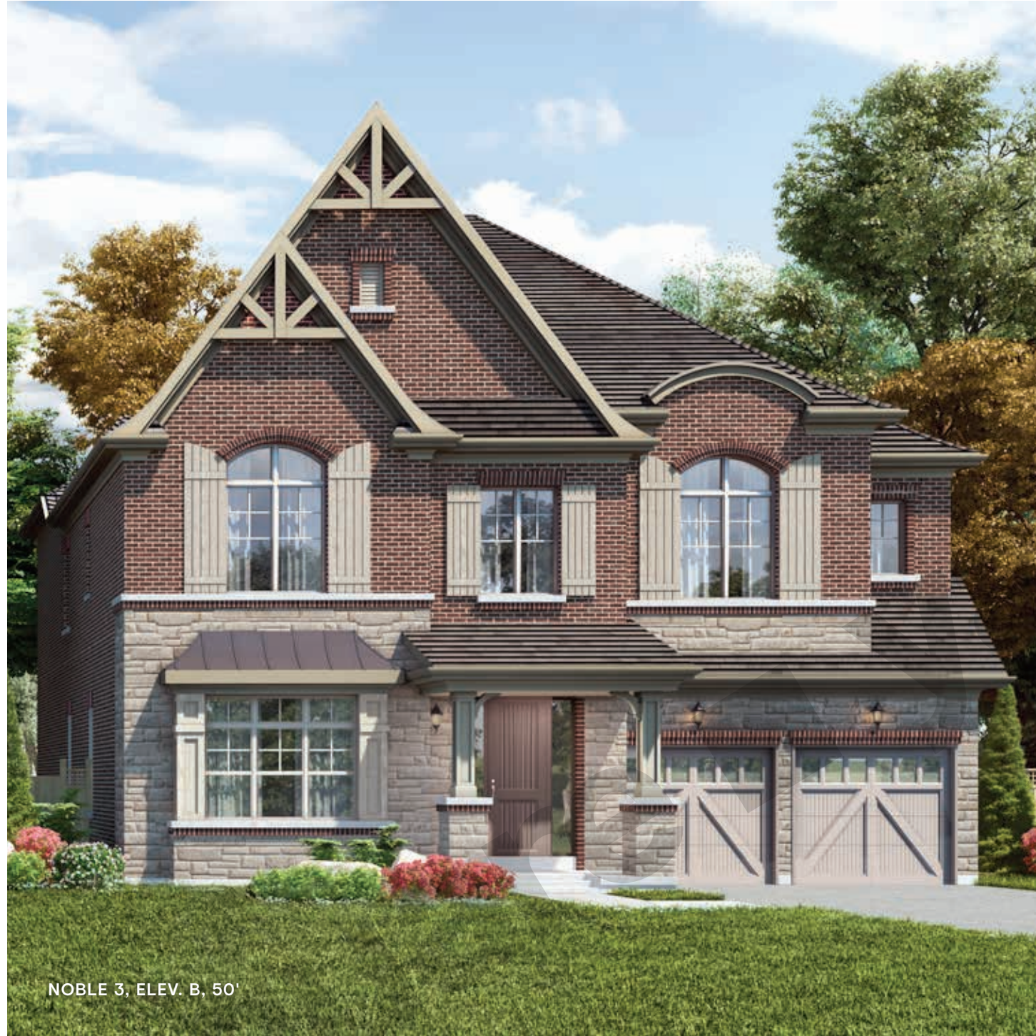
NOBLE 3, ELEV. B, 50'