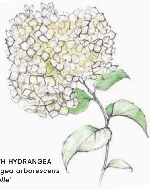
SMOOTH HYDRANGEA Hydrangea arborescens 'Annabelle'