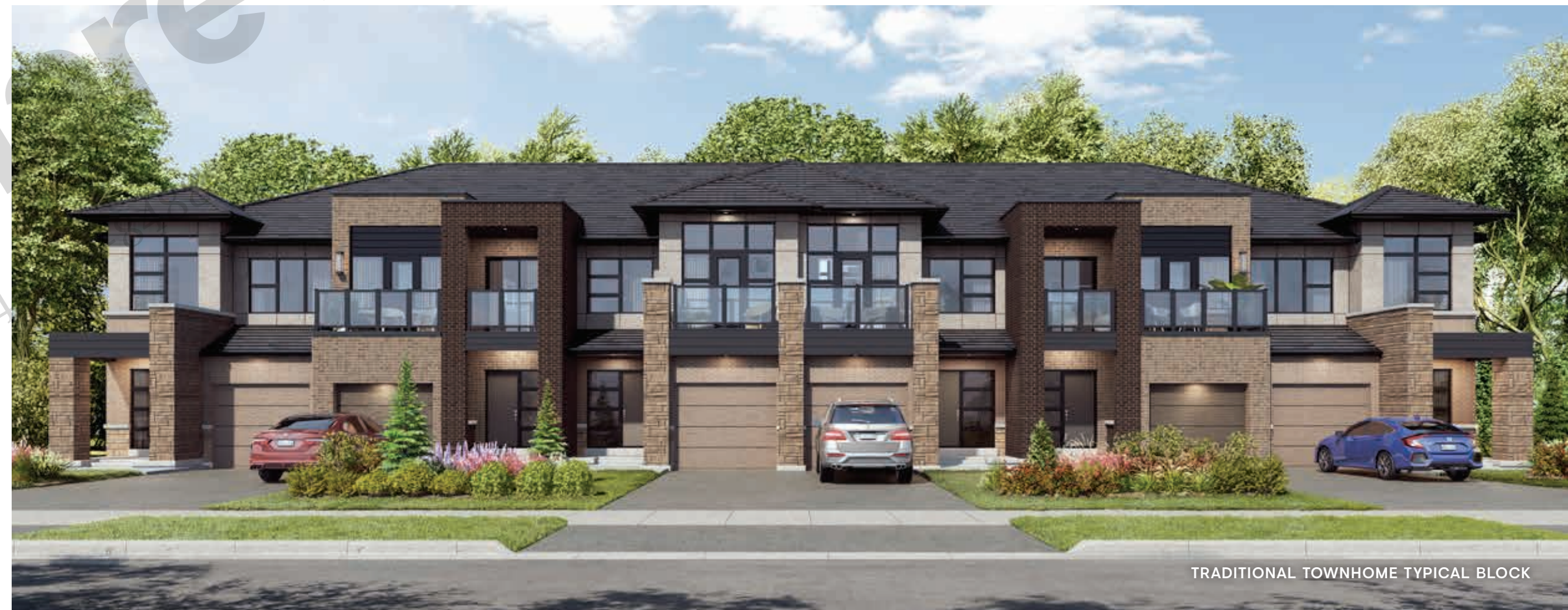
TRADITIONAL TOWNHOME TYPICAL BLOCK