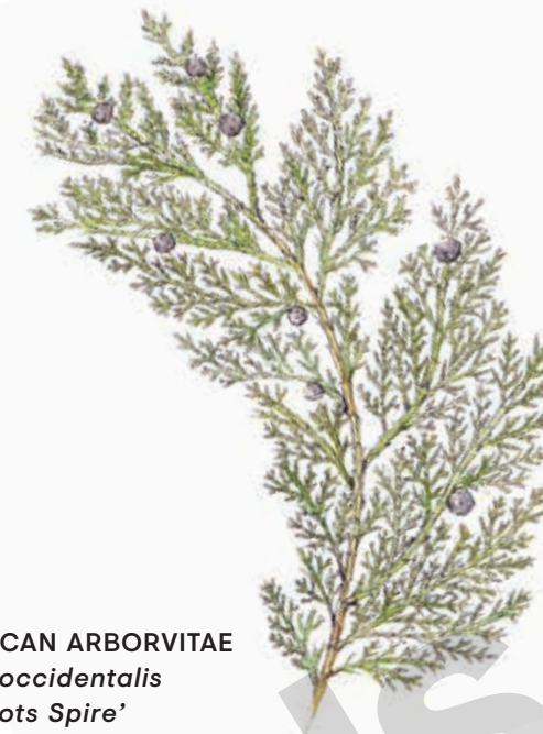
AMERICAN ARBORVITAE Thuja occidentalis 'Degroots Spire'