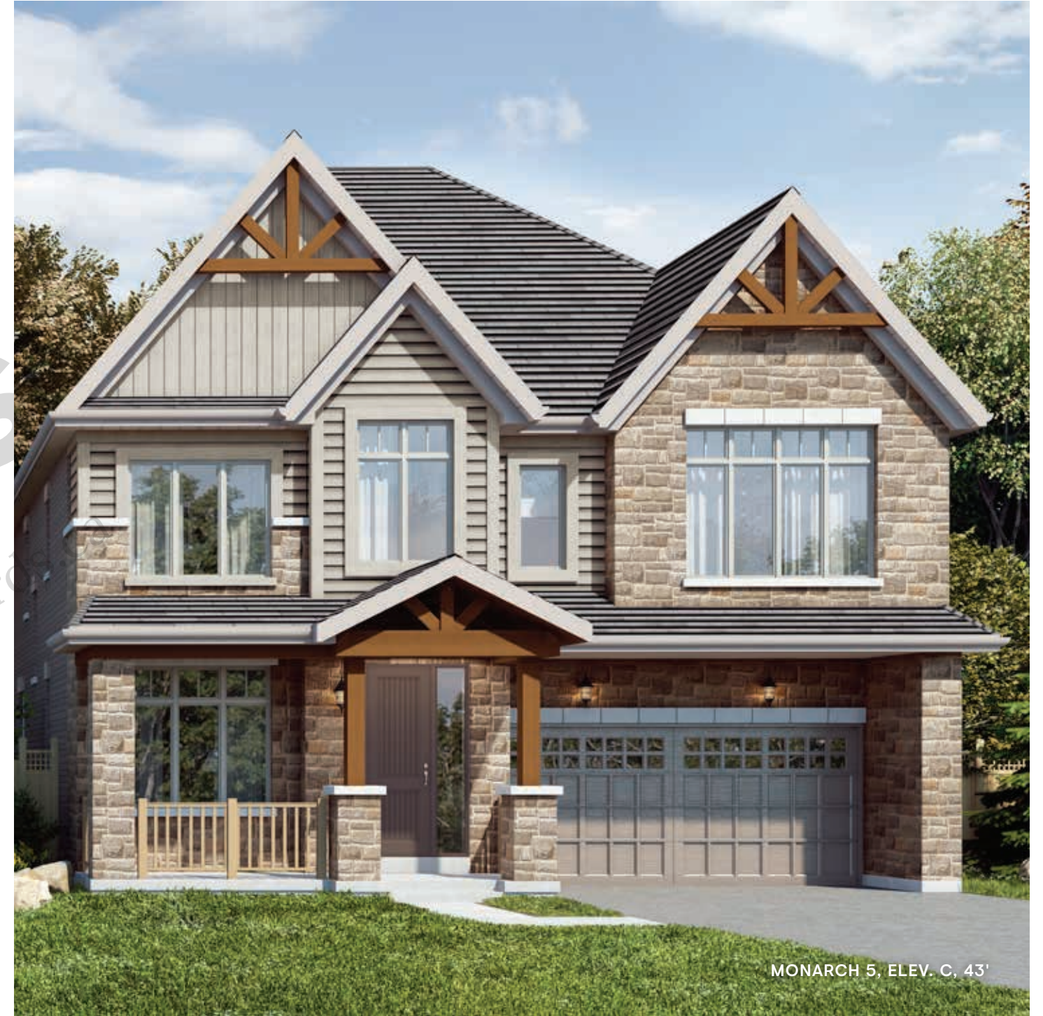
MONARCH 5, ELEV. C, 43'