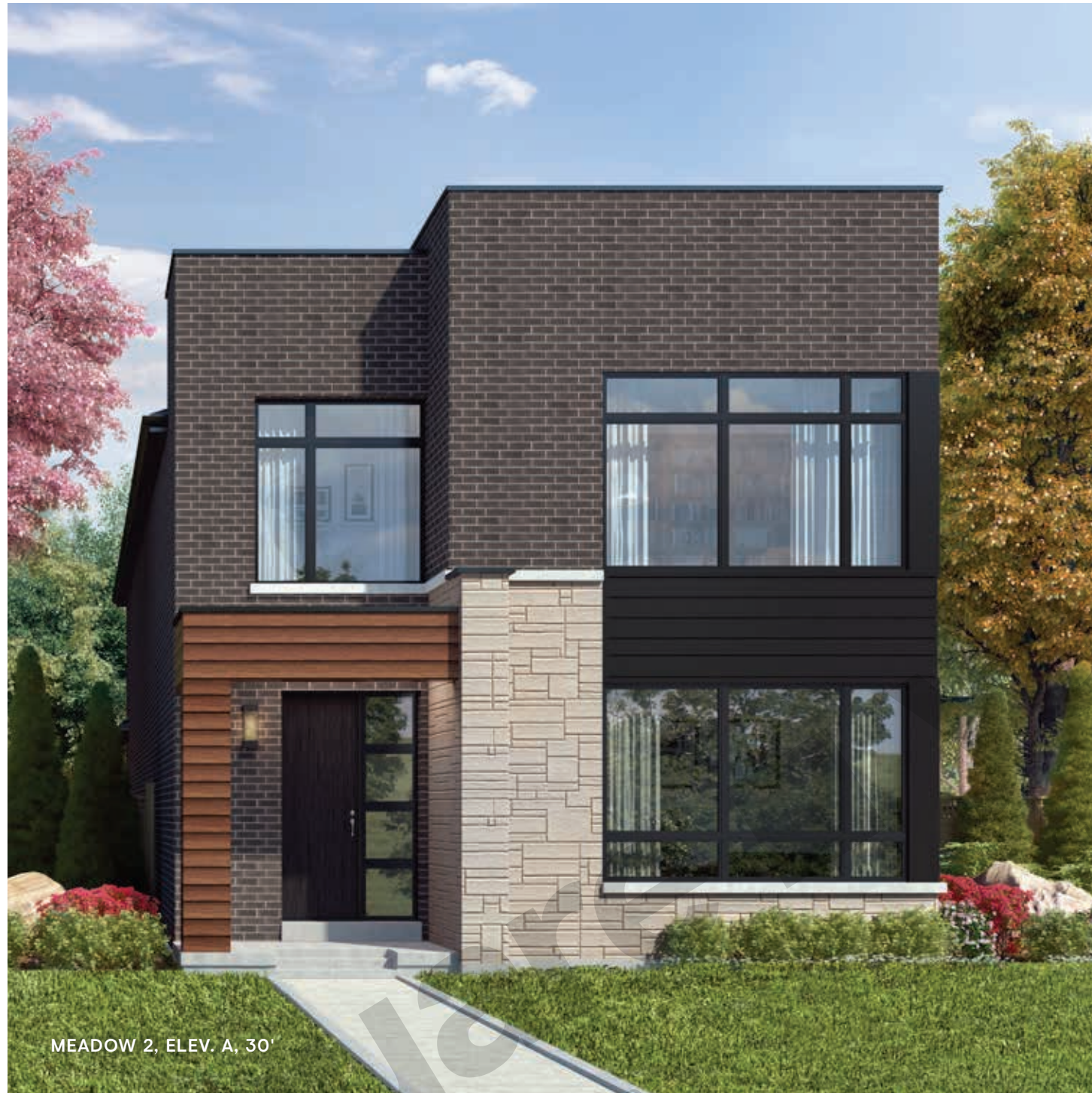
MEADOW 2, ELEV. A, 30'