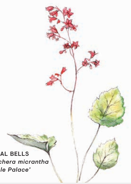
CORAL BELLS Heuchera micrantha 'Purple Palace'