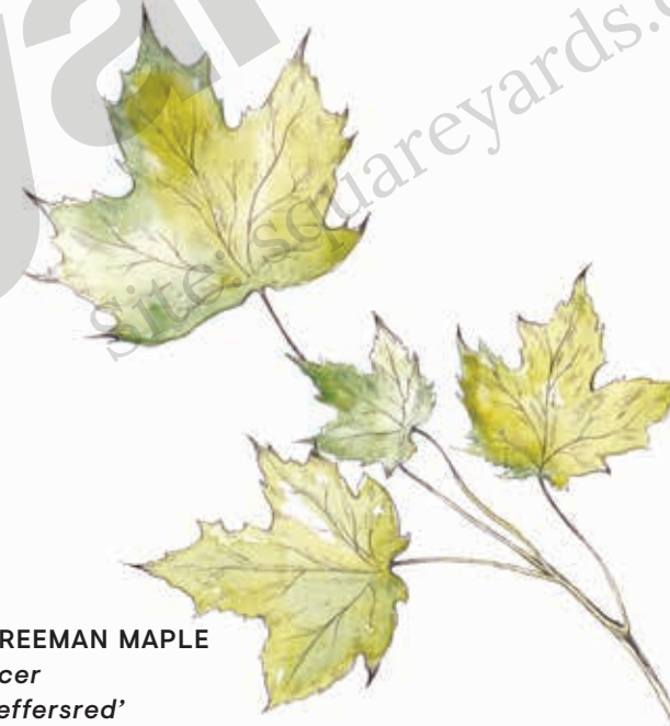
FREEMAN MAPLE Acer 'Jeffersred'