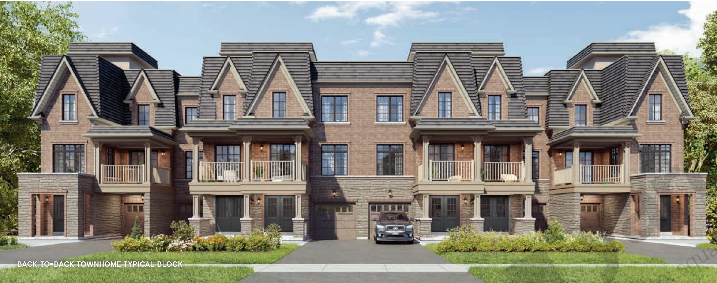
BACK-TO-BACK TOWNHOME TYPICAL BLOCK

BACK-TO-BACK TOWNHOMES | Back-to-back townhomes at Union Village are available in French Country or Modern / West Coast Contemporary styles and feature open concept layouts, full-height basements, and rooftop terraces, providing maximum space with a minimal footprint.