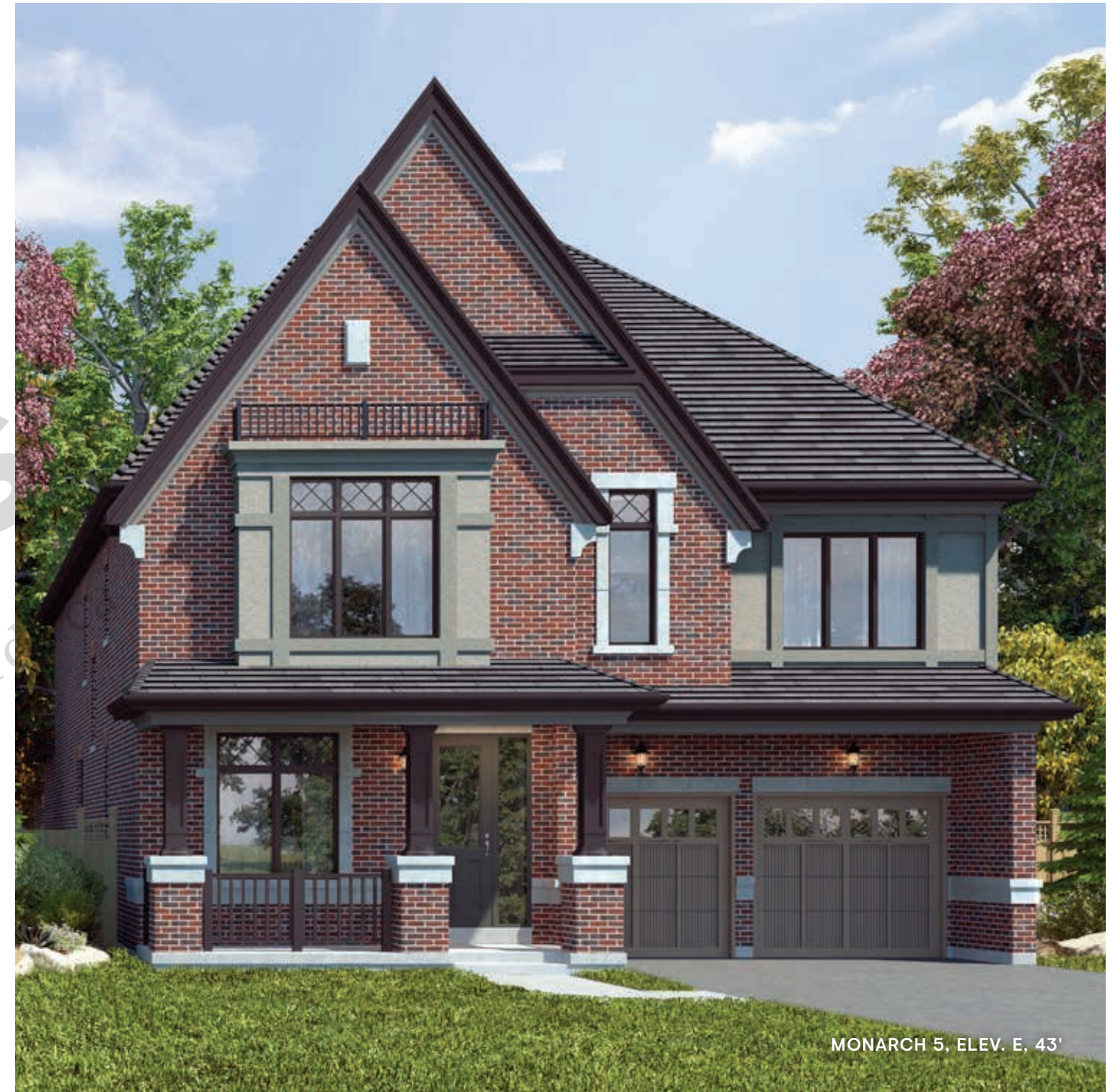
MONARCH 5, ELEV. E, 43'

Brick, stucco, stone and/or metal siding.