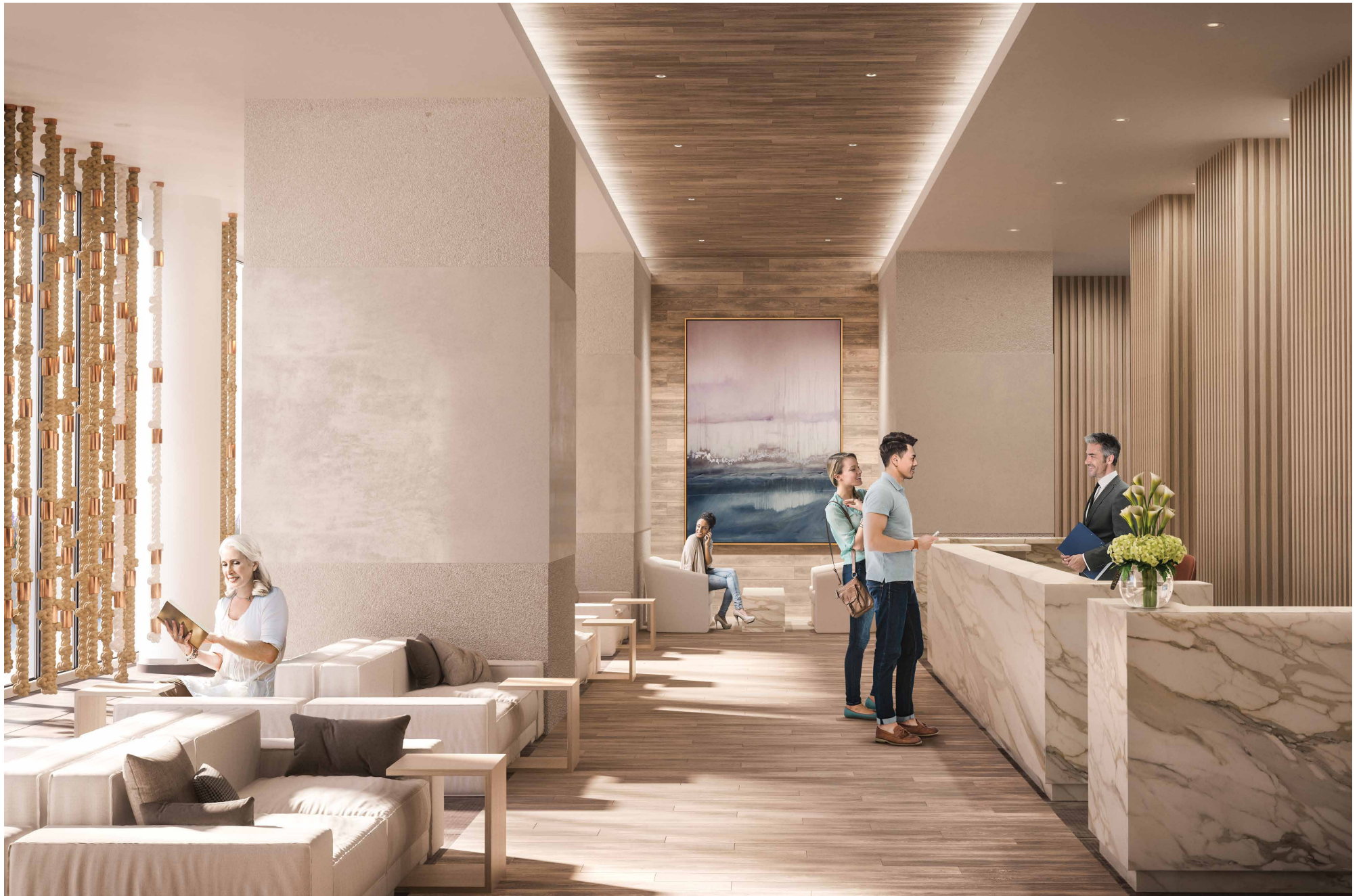
RESIDENTIAL CONDOMINIUM LOBBY